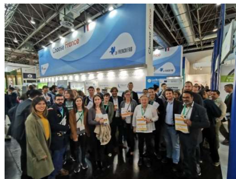
Pictures 1, 2 and 3: Percy consortium at a Trade Fair for Plastics and Rubber in Dusseldorf, Germany